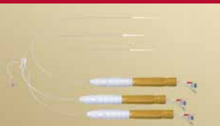
The Aortic Bifurcate Delivery System working length: 54 cm Iliac Limb Delivery System working length: 77 cm